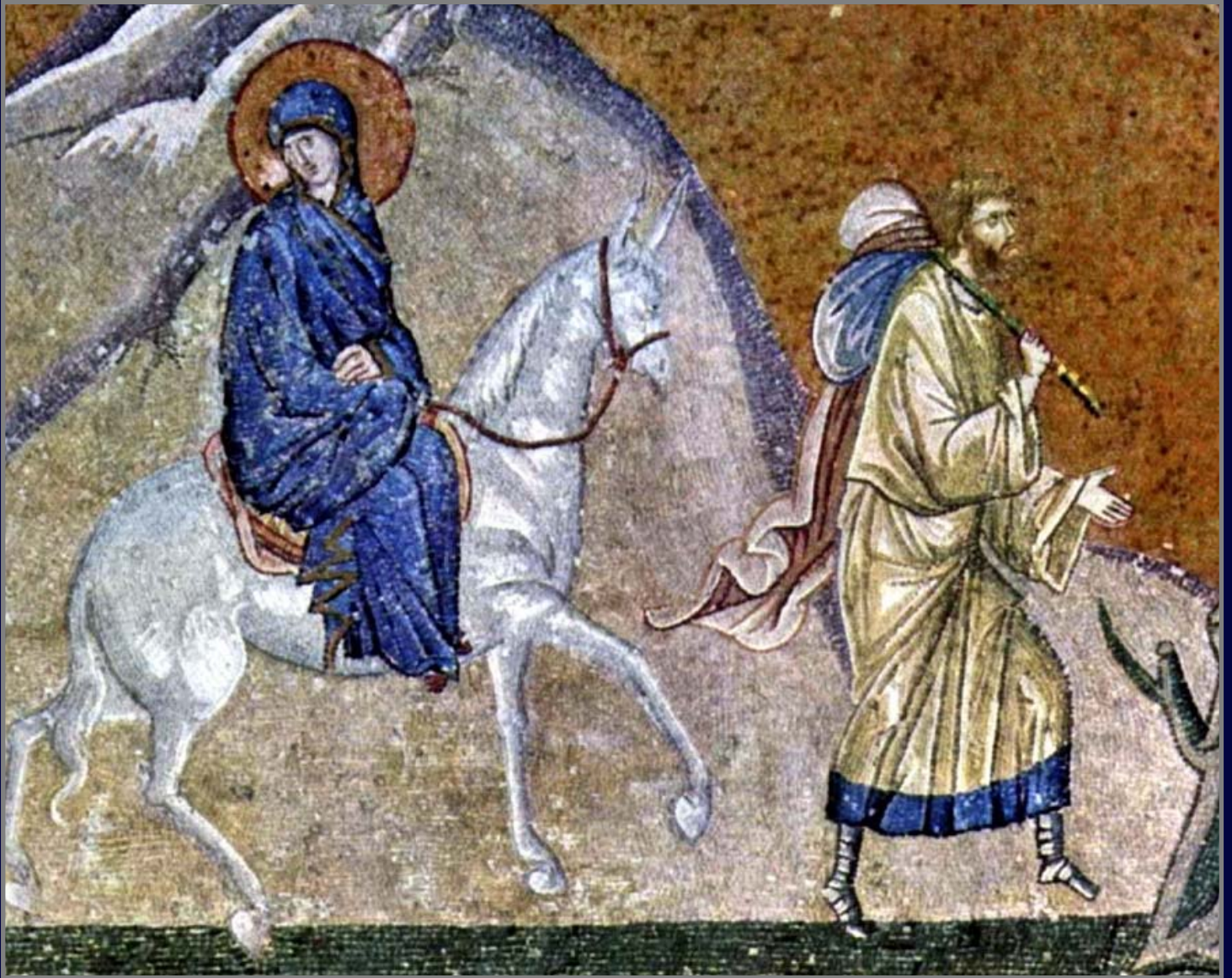
Mosaic of the Journey to Bethlehem (1315-1320)

December 17, 2017 / 17 de Diciembre de 2017