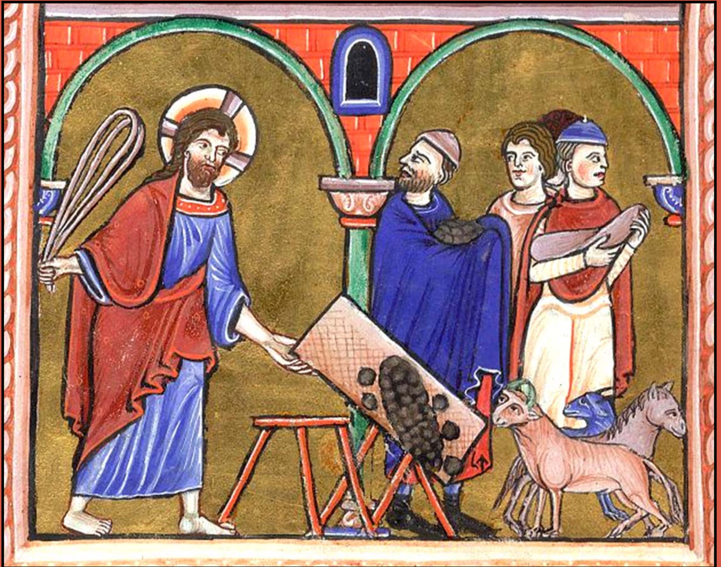
Jesus cleanses the temple

You enter this church... not as a stranger, but as a guest of God. He is your heavenly Father. Come, then, with joy in your heart and thanks on your lips into His presence, offering Him your love and service. Be grateful to the strong and loyal ones who, in the name of Jesus Christ, built this place of worship, and to all who have beautified it and hallowed it with their prayers and praise. Ask His blessing on those who love His house of faith as the inspiration of their labor, rejoicing in the power of the Holy Spirit, and may that blessing rest on you, both on your going out and your coming in.